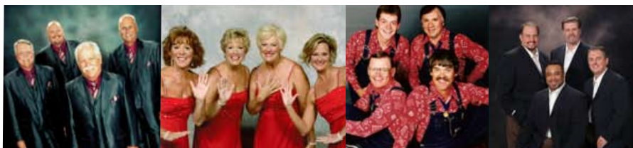
The King's Heralds