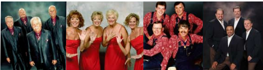
The King's Heralds

Watch for the Heralds on WFLA News Channel 8 Early Morning Show on November 28th!