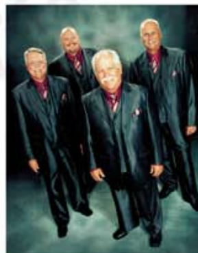
A Quartet of Champions Flashback