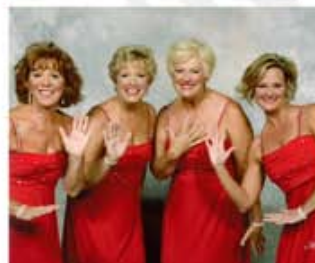
Fabulous quartet from the awarding winning Spirit of the Gulf Sweet Adelines Chorus Cliché