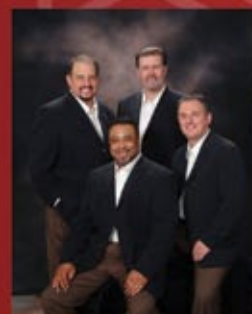
International recording artists and world touring gospel quartet The King's Heralds