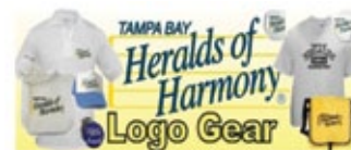
HoH Logo Gear

Get Barbershop Merchandise at Harmony Marketplace!