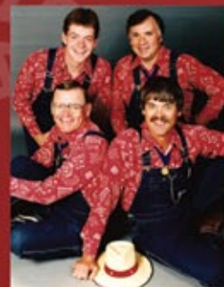
1986 International Quartet Gold Medalist