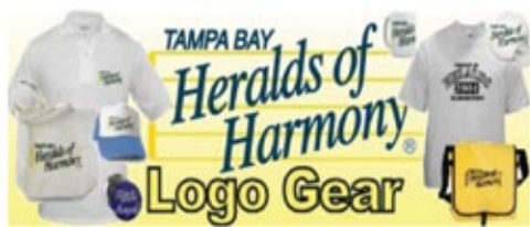
HoH Logo Gear

Get Barbershop Merchandise at Harmony Marketplace!